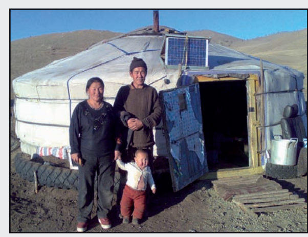
A Mongolian family achieving decentral electrification

With other financial partners, further projects are in preparation for Kenya, Tanzania, Rwanda and Indonesia.